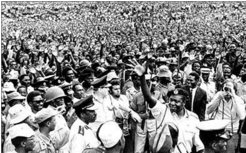
Idi Amin greeting a cheering crowd in a 1971 photograph after overthrowing Apollo Milton Obote in a military coup and being hailed "Jogoo! Jogoo!" ("Hero! Hero!"), by fellow soldiers

Was Idi Amin "Framed" or "Guilty as Charged"? Was something "insidious" going on during his rule in Uganda as alleged by many? What role did racism, colonialism, neocolonialism, classism, religion, tribalism and greed play in "creating" Idi Amin? What should be made of the "conspiracy theories" relating to the actual "culprits" being "at large"? Who are these "culprits" and should the "ruling" by alleged "kangaroo courts" that have presided over his case to date be accepted as final? What would the "evidence" show in a proper Court of Law in relation to allegations of "mass murder", economic unfairness towards Ugandan Asians and the "conspiracy theories" that have surfaced since Idi Amin was ousted from power? What should be made of the conflicting characterization of Idi Amin as a Hero and Villain at the same time? What are the lessons the global community can learn from his actual story?